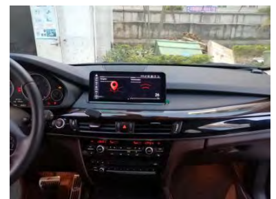
12. Effect photo after installation well.