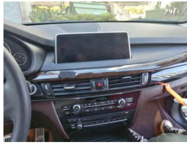
2. pry loose and take out the decoration strip.