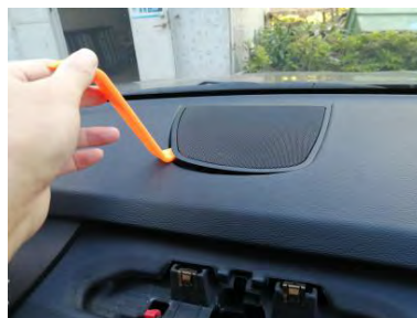
8. Pry loose the net and take out the center speaker.