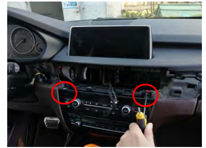
3. Remove the fixed screws from panel.