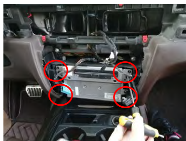
7. Remove the fixed screws from original HOST.