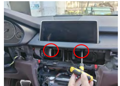
6. Remove the fixed screws from original monitor.