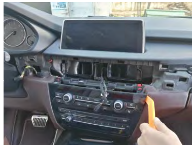
5. Pry and take out the air-conditioning panel.