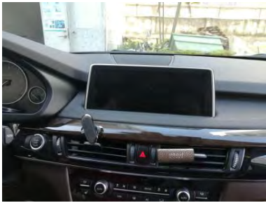
1. Original Monitor (Power off before installing).