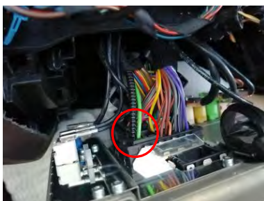
10. Pull out the original power harness and optical fiber, then plug it with Android power harness.