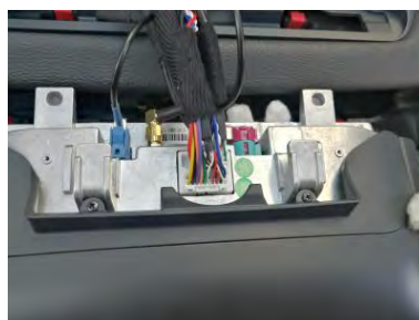
11. Plug well all the cables.