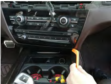
4. Pry and take out the panel.