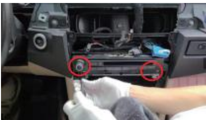
7. Remove the fixed screws from the Host.