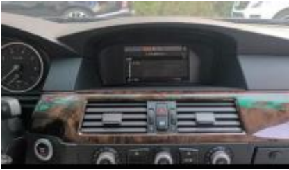
1. Original Monitor (Power off before installing).

After the successful activation,wait for 5 seconds,and Please DONOT disconnect the wires between the Activator and the Car,make sure keep the connection!Then remove the car key and lock the car,Wait after the "P" Gear(Parking) indicator is off, power on the car again.Then get on the car to check the AUX function!