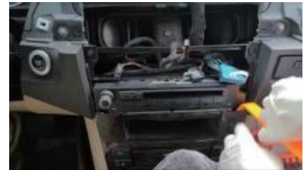
6. Pry and take out the panel of the storage box.