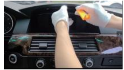
3. Pry loose and take out the original monitor.