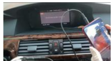
12. Connect phone with AUX IN to full test AUX function.