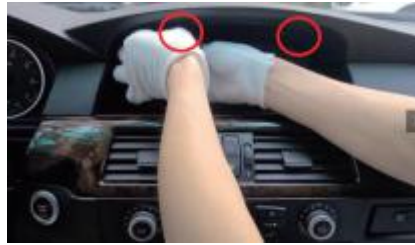
2. Remove the fixed screws from original monitor.