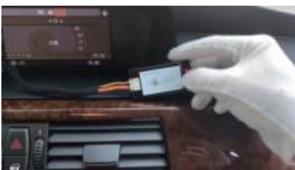
10. Plug in the Activator and start the car. Long press the activation button until the indicator light is steady on, and "AUX" function will display on original menu.