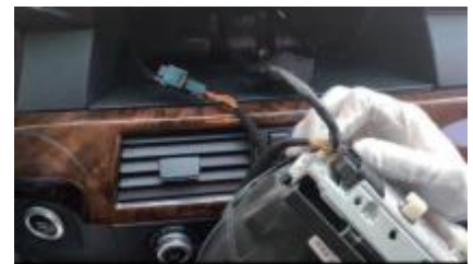
9. Connect well The AUX activator with original monitor.