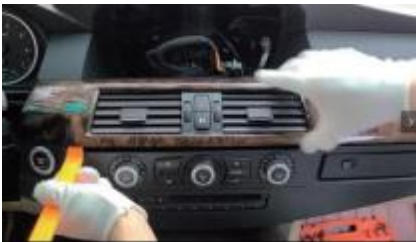
4. Pry loose and take out the decoration strip.