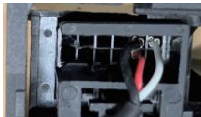
8. Take out the original harness and plug three AUX wires into harness as picture show.