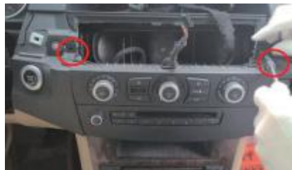
5. Remove the fixed screws of the panel.